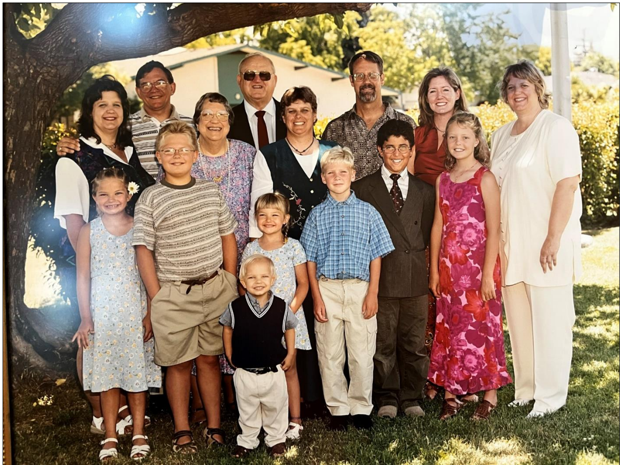
50 th wedding anniversary in 2002